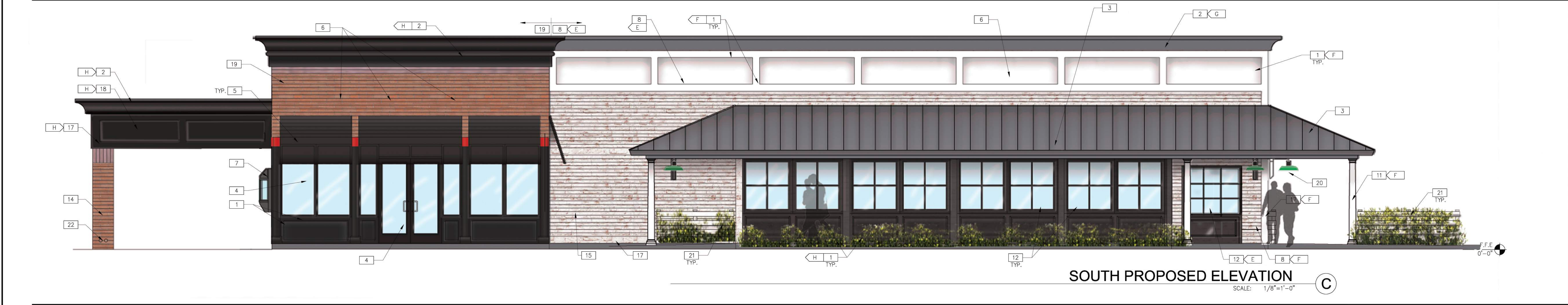
SOUTH PROPOSED ELEVATION