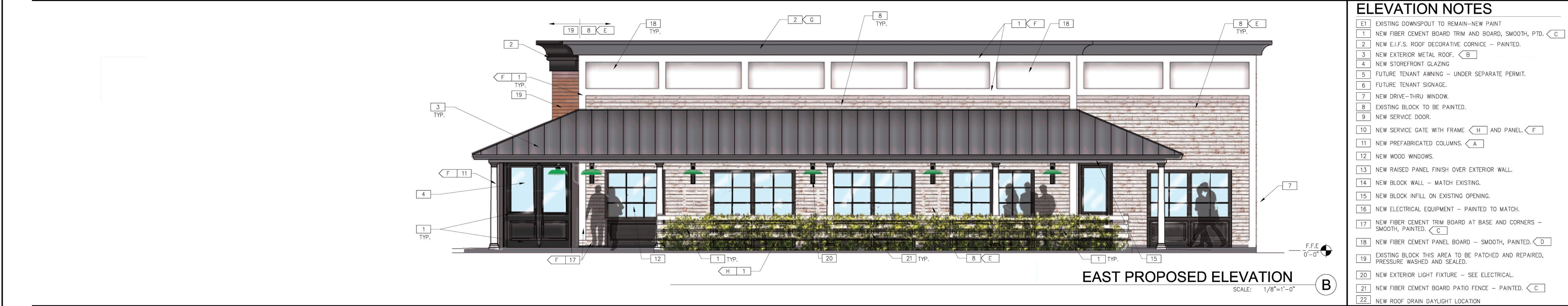
EAST PROPOSED ELEVATION