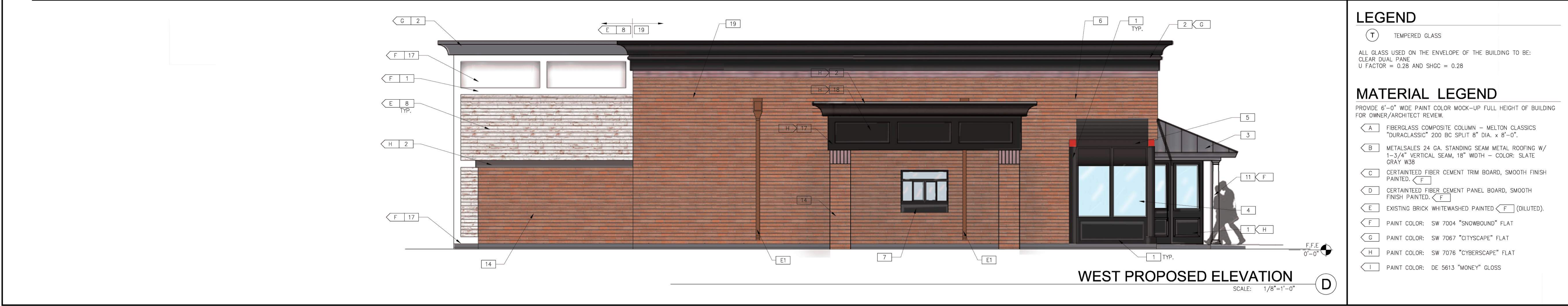
WEST PROPOSED ELEVATION