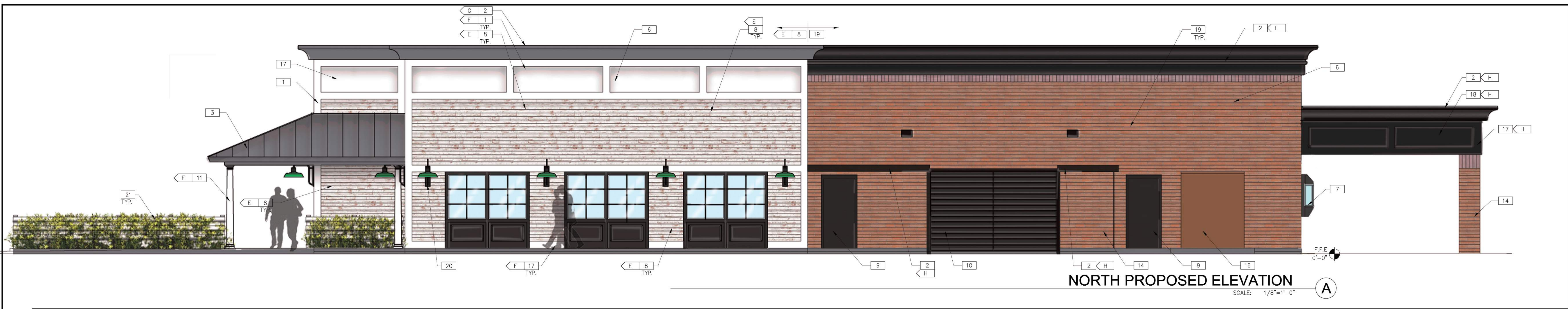
NORTH PROPOSED ELEVATION