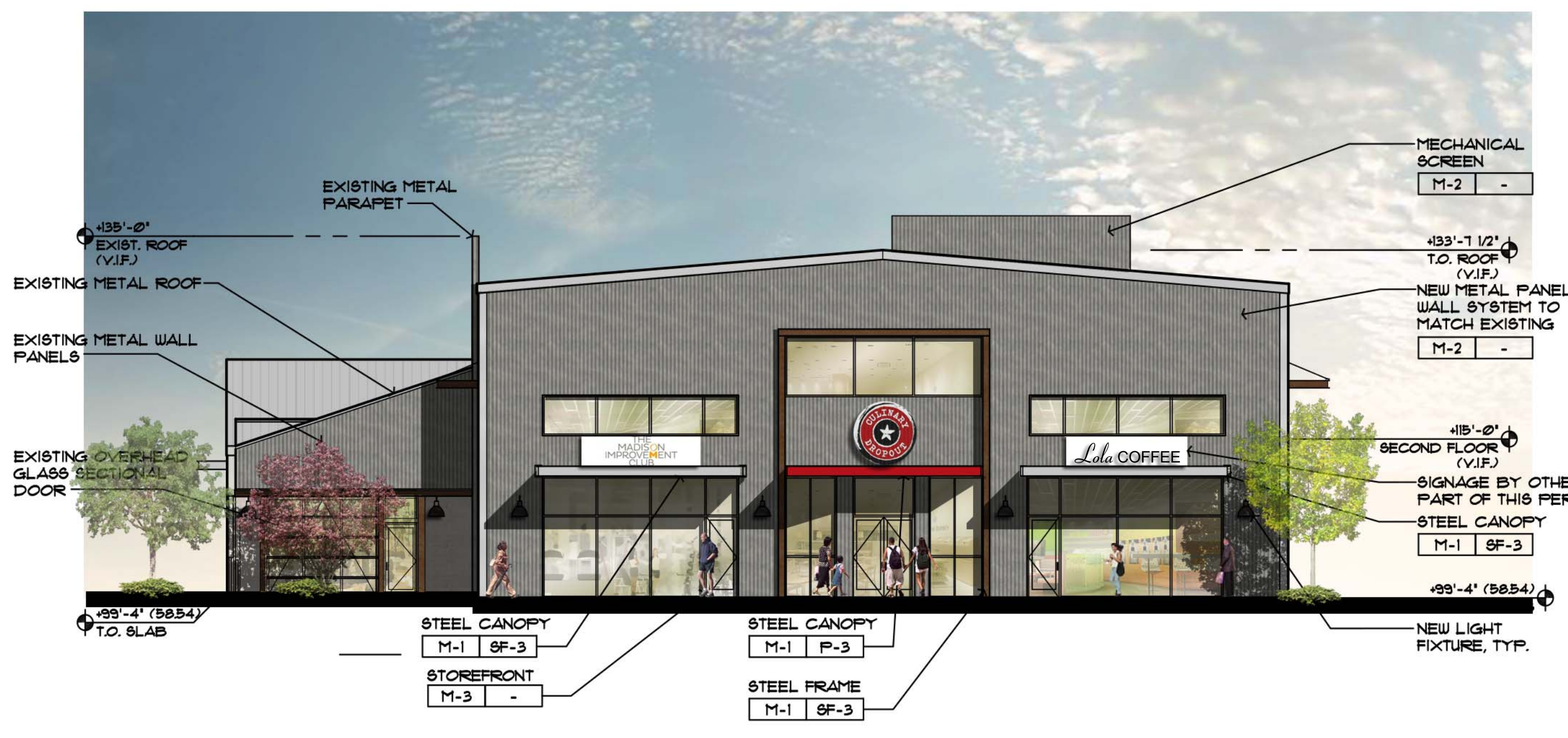
03 SOUTH ELEVATION SCALE: 3/32"=1'-0" REF: 01/A201