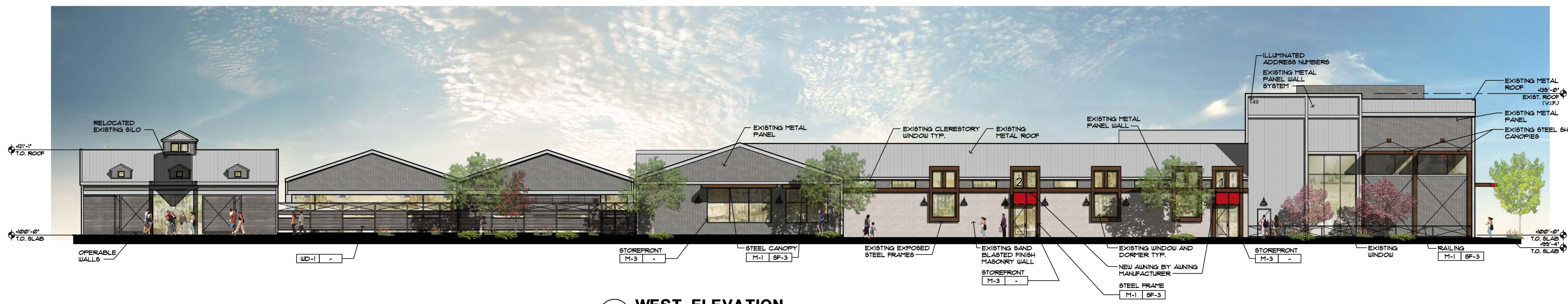
01 WEST ELEVATION SCALE: 3/32"=1'-0" REF: 01/A201